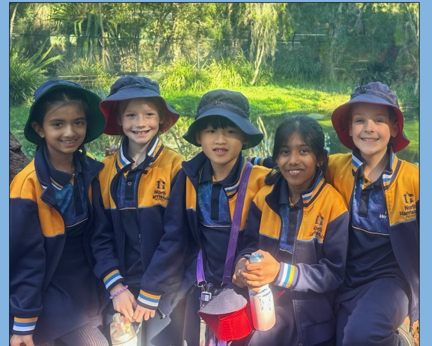
ALL GRINS: The Year 3s had a wonderful excursion to Perth Zoo.