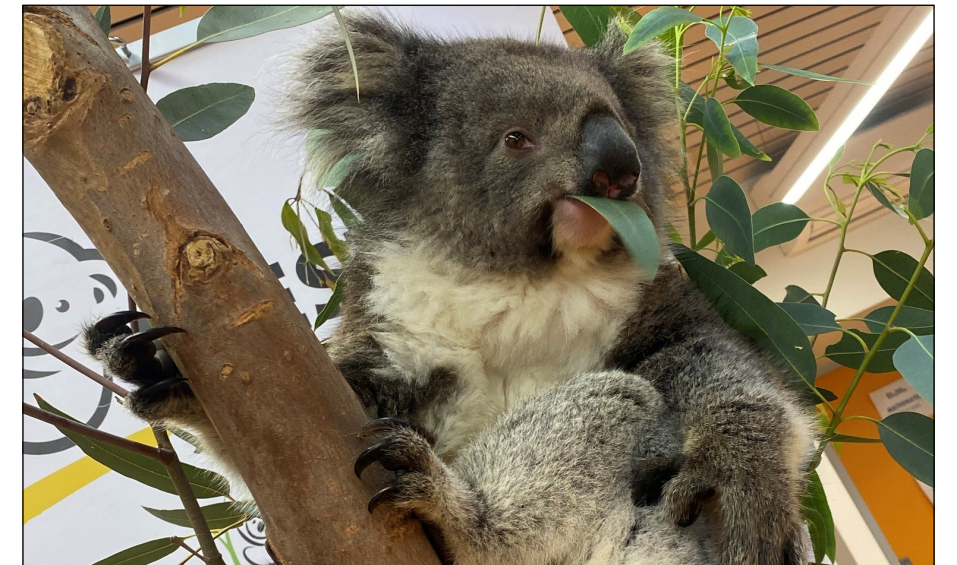
CUTENESS OVERLOAD: The West Oz Koala Keira got plenty of pats.

was something for everyone to enjoy during the week.