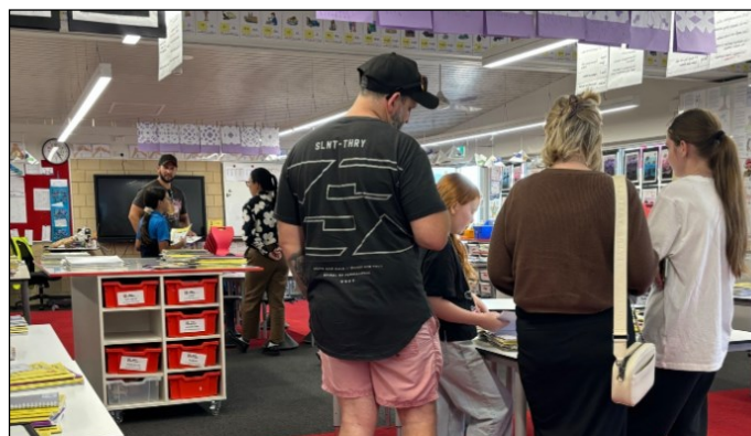
JOY: Parents admiring work at the Learning Journey.

For a special afternoon in Term 4, all of the classrooms and learning spaces in the school were opened to allow parents and