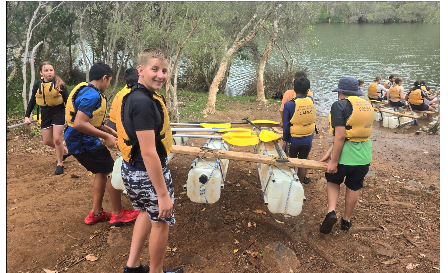
FLOATING (sometimes!): Raft building was a highlight for many of the Year 6 students while on camp.