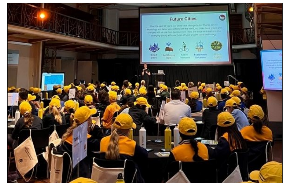
FUTURE FOCUS: Students making plans for 2050 at the RAC Hackathon.

The two North Harrisdale teams had weekly webinars during Semester One