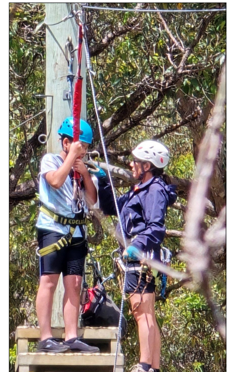
GUTS: Taking the leap off the flying fox platform took bravery.

Now that the camp is over the Year 6s move full steam ahead towards graduation.