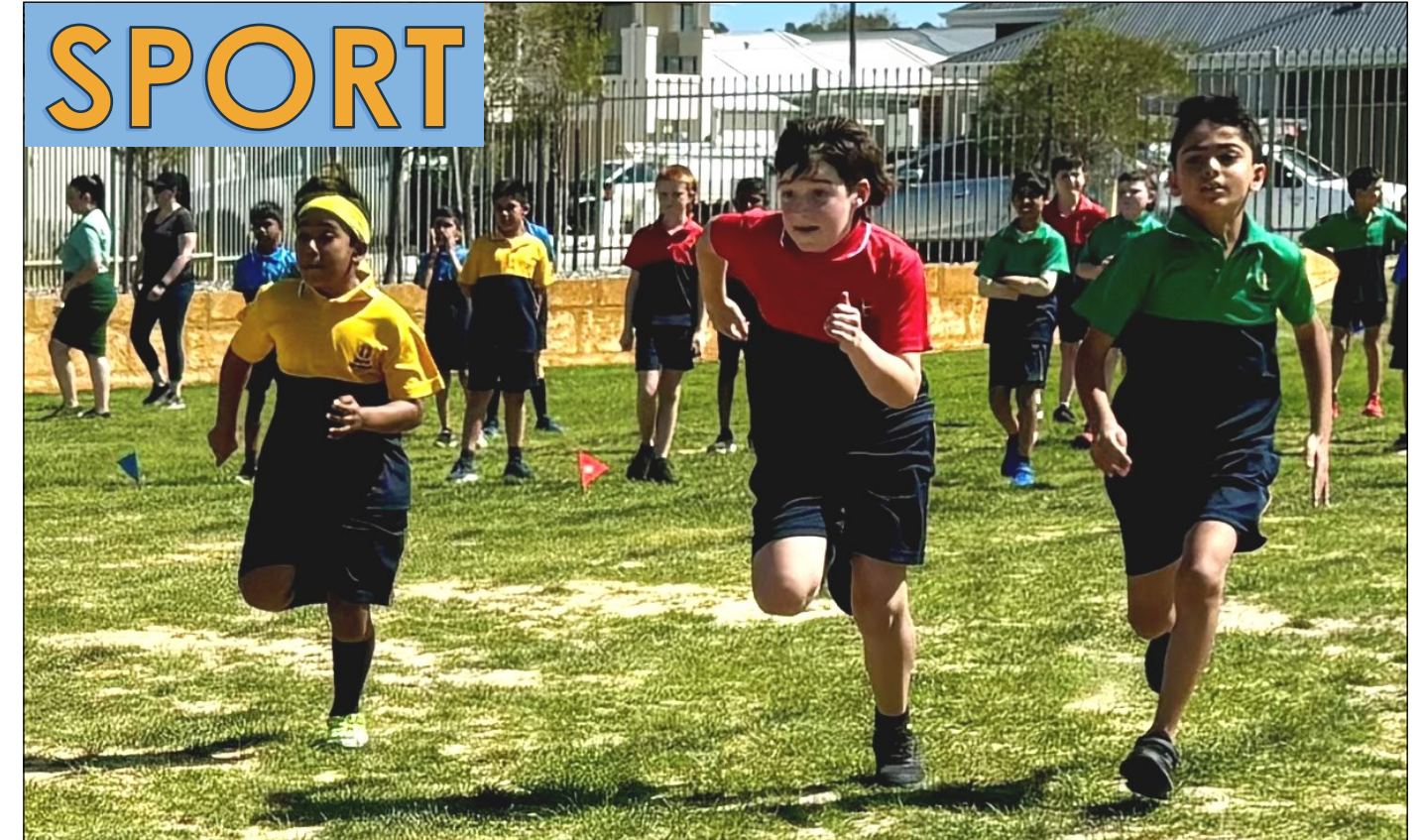
PUSHING THE BOUNDARIES: The race to be crowned champion house was fierce all day long.

Stay tuned to the NHPS Facebook page for more updates.