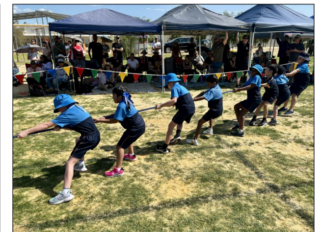
PULL: Bellatrix participating in the Tug of War.